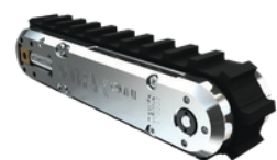
XTRAX Omni [Stainless Steel]