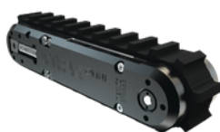
XTRAX Omni [Aluminium]

Fitted with the Scope HD camera which has pan, tilt and zoom, and driven by the aluminium XTRAX Omni, this configuration is a versatile inspection solution.